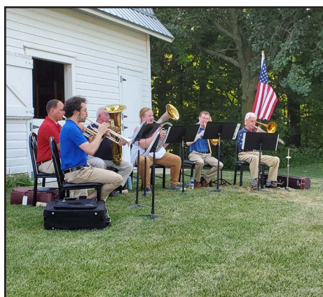
Butler County Brass at Pioneer Bluffs

Cost: $25 per person, includes appetizers and concert