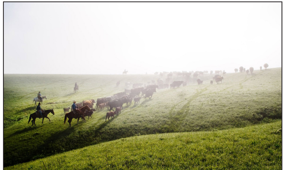
Foggy morning cattle drive with Ryan Arndt & crew north of Bazaar cattle pens.